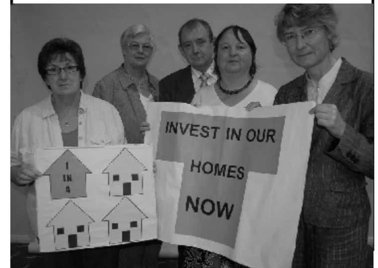
Fiona Hall MEP with Liberal Democrats from Stockton

Fiona Hall MEP has joined Liberal Democrats locally in calling for a fair deal for council housing in the North East where 1 in 4 council houses is below standard but the call has landed on deaf ears at Westminster.