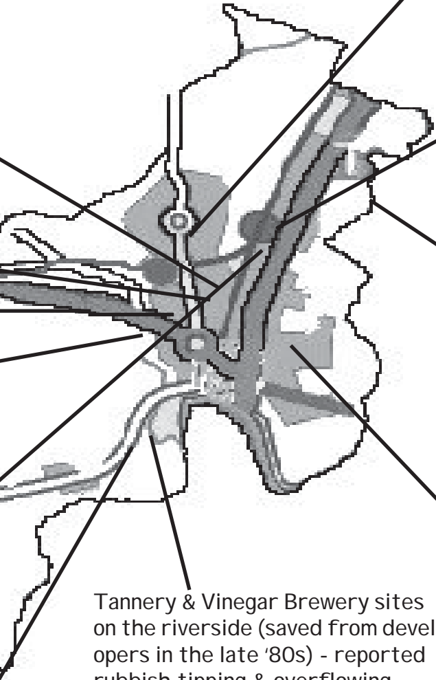
Tannery & Vinegar Brewery sites on the riverside (saved from developers in the late '80s) - reported rubbish tipping & overflowing sewage. Stopped the character of the riverside being changed by street lighting.