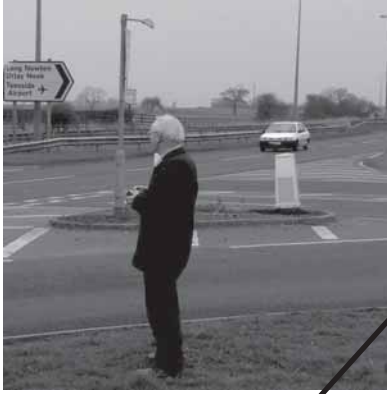
Asked for the bus shelter at Burdale Close on Kingsmead

Maureen campaigned with residents for the grade separated junction on Kingsmead at Long Newton which will benefit all the area.