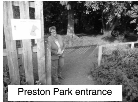
Preston Park entrance

that we do not lose the benefits of mature trees for future generations as some existing ones reach the end of their lives