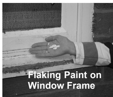
Flaking Paint on Window Frame

No doubt those in homes that were owned by the Council and managed by Tristar are wishing they